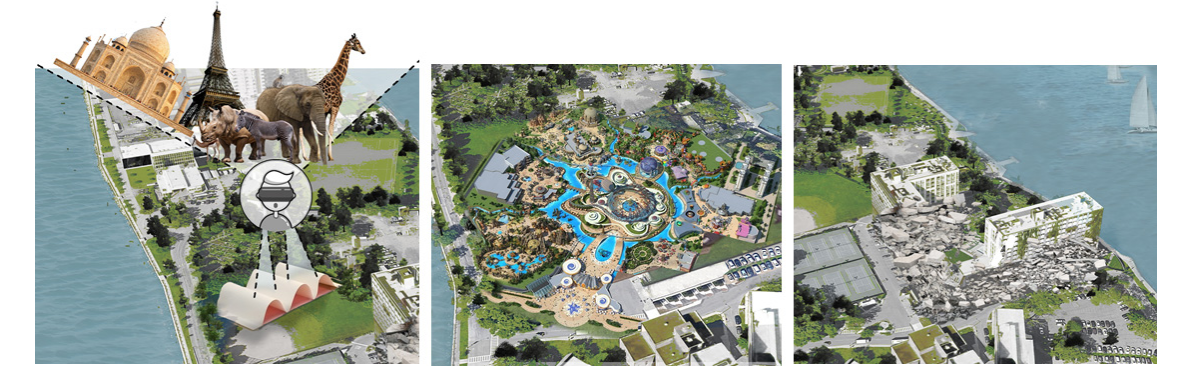
Figure 2: Youth proposals rendered on the Pinnacle (an alias for an island condominium) site: virtual reality zoo/cultural center (left), spa kingdom (middle), and destroying the Pinnacle (right). Renderings produced by authors

In the following two sections, we narrate the internship process chronologically, focusing on two ethnographic episodes: 1) the students' design proposals, and 2) their presentation of these proposals at the senior center. After each episode, we discuss the key observations and findings that resulted. In the subsequent sections, we synthesize the themes and ideas appearing across the episodes, and their implications for design theory and pedagogy.