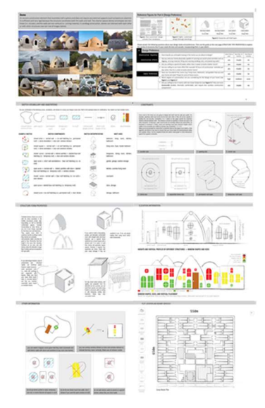
Figure 2: Selected pages from the paper interface (toolkit)